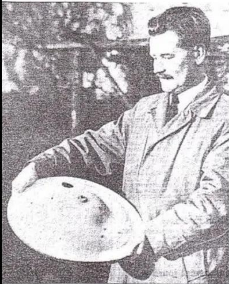
The object found on Silpho Moors.

Mystery object found on Scarborough moors HAS 'UNUSUAL HIEROGLYPHICS'